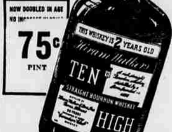
THIS WHISKEY IS NOW 2 YEARS OLD

Under old-fashioned methods, whiskey aged only during the warm summer months. But TEN HIGH, the whiskey with "no rough edges," ages 8 summers in 2 years' time in the weather-controlled rickhouses of the world's largest distillery. Learn that ripe whiskey can be had at a right price. Try TEN HIGH tonight!