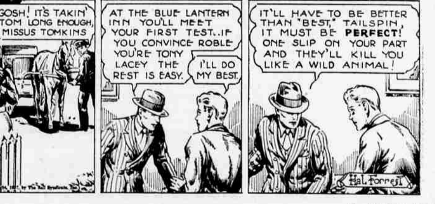
(Copyright, 1937, by The Bell Syndicate, Inc.)