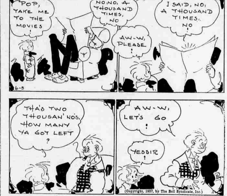
(Copyright, 1937, by The Bell Syndicate, Inc.)