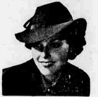
"WHIP"... As Seen in VOGUE