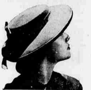
"FIESTA"... As Seen in VOGUE

THERE'S ingenuity in "Whip's" cleverly manipulated crown and one-side-flange; there's serene poise in "Fiesta's" discus brim, curtained with a ribbon edge to enhance the brow. Both from Quinley's diverse collection of striking new designs. Fels, Four and Five Dollars. Straws, Four Dollars, Five Dollars and upward. Millinery Second Floor