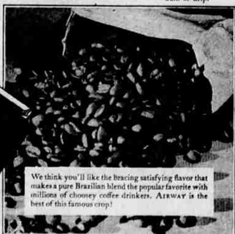
We think you'll like the bracing satisfying flavor that makes a pure Brazilian blend the popular favorite with millions of choosy coffee drinkers. AIRWAY is the best of this famous crop!

Packed in a sensible, moisture-proof, lock-top bag that frankly saves you money.