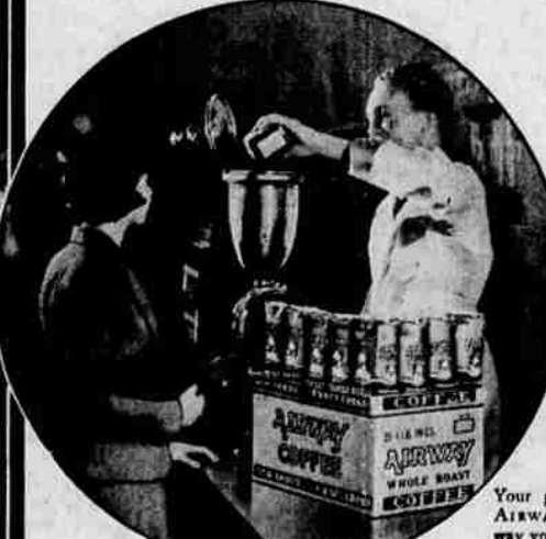
Your grocer grinds AIRWAY exactly the way you want it: for percolator, pot, vacuum or drip.

That's why AIRWAY COFFEE is sold in the bean... ground while you wait. Notice that flavor! How rich and delicious it tastes! How temptingly fragrant it smells. AIRWAY is outstandingly fine coffee... 100% pure Brazilian... superbly blended. It sounds expensive... tastes expensive... but actually costs very little. You can't lose! Buy it... like it... or your money back!