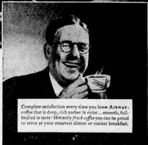
Complete satisfaction every time you brew AIRWAY coffee that is deep, rich amber in color... smooth, full-bodied in taste! Honestly fresh coffee you can be proud to serve at your smartest dinner or coziest breakfast.

TODAY'S COFFEE CUP—LET 'WILLIAM LIKES THE BEST OF COFFEE!' WILLIAM'S MOTHER TOLD THE BRIDE. SO HE'S GETTING AIRWAY DAILY AND THEY'RE SAVING CASH BESIDES!