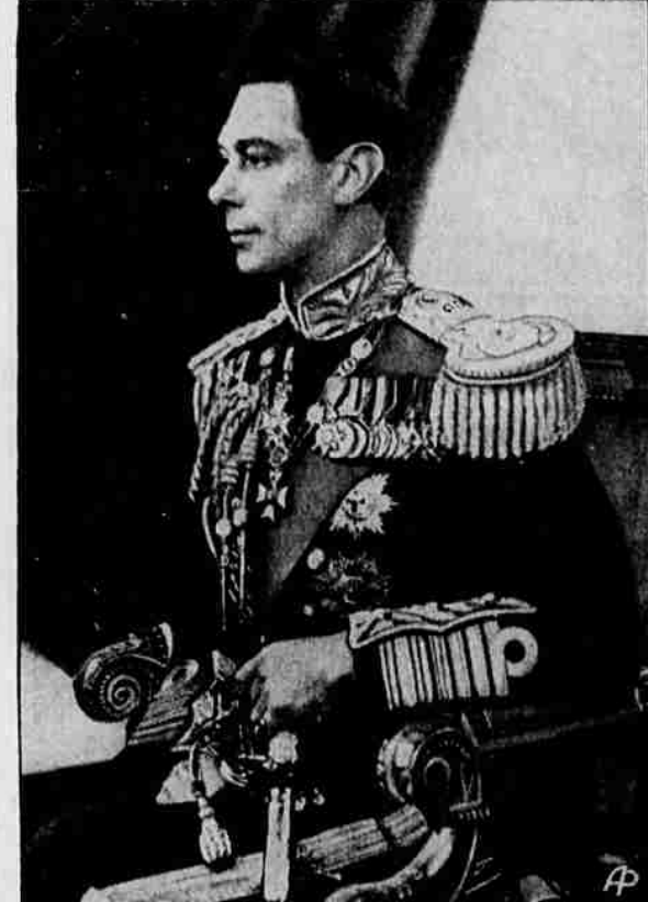
King George VI

ghost-like out of the night, with thousands sleeping out in Hyde park on the streets and even in the gutters, then breakfasting on the curbstones to maintain their points of vantage.