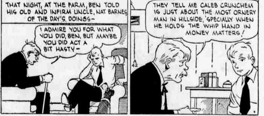
THEY TELL ME CALEB CRUNCHER IS JUST ABOUT THE MOST ORNERY MAN IN HILLSIDE, ESPECIALLY WHEN HE HOLDS THE WHIP HAND IN MONEY MATTERS!