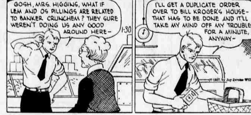
GOSH, MRS. HIGGING, WHAT IF LEM AND OS PILLINGS ARE RELATED TO BANKER CRUNCHER? THEY SURE WEREN'T DOING US ANY GOOD AROUND HERE—