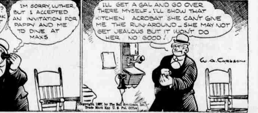
I'LL GET A GAL AND GO OVER THERE MYSELF. I'LL SHOW THAT KITCHEN ACROBAT SHE CANT GIVE ME THE RUN-AROUND—SHE MAY NOT GET JEALOUS BUT IT WON'T DO HER NO GOOD!