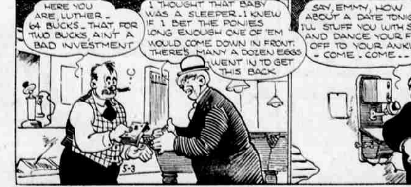
HERE YOU ARE LUTHER—64 BUCKS—THAT FOR TWO BUCKS AINT A BAD INVESTMENT