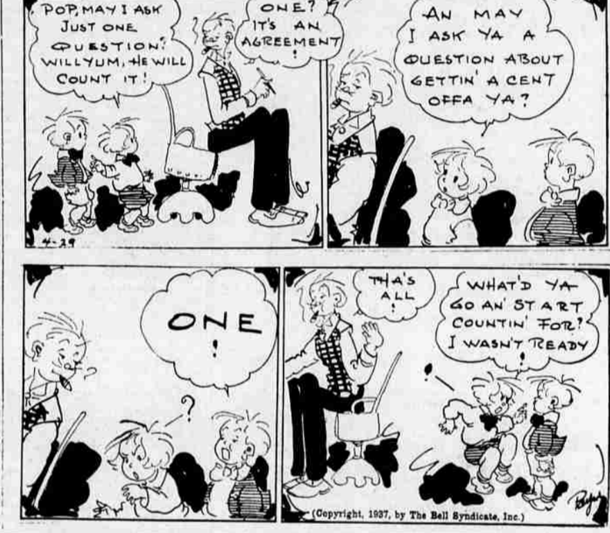
POP, MAY I ASK JUST ONE QUESTION? WILLYUM, HE WILL COUNT IT!