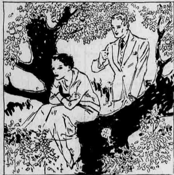
Some of the desolate, numb misery slipped away from Eve.

To Hide For A While EVE stood watching till they were out of sight. She could hear the little boy sobbing on upstairs and Uncle Henry's voice quieting him. And there seemed nothing anywhere any more. . . . Nothing but the everlasting ringing of the telephone. She answered it. Mrs. Minturn over the Ridge: a loaf of bread, two dozen