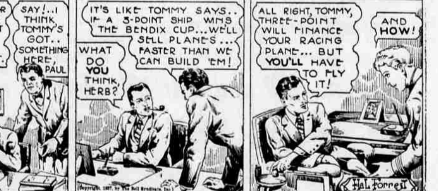
ALL RIGHT, TOMMY, THREE-POINT WILL FINANCE YOUR RACING PLANE... BUT YOU'LL HAVE TO FLY IT!