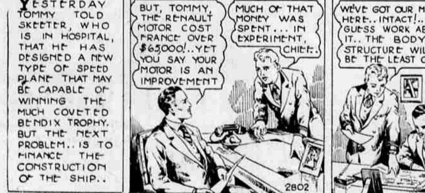
YESTERDAY TOMMY TOLD SKEETER, WHO IS IN HOSPITAL, THAT HE HAS DESIGNED A NEW TYPE OF SPEED PLANE THAT MAY BE CAPABLE OF WINNING THE MUCH COVETED BENDIX TROPHY. BUT THE NEXT PROBLEM... IS TO FINANCE THE CONSTRUCTION OF THE SHIP.