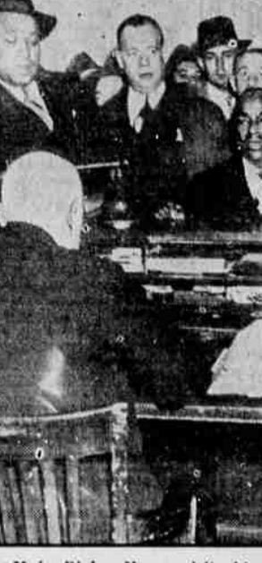
Father Major Divine, Negro spiritual leader who says he is "God," was found hiding in the basement of his Milford, Conn., "heaven" after a three-day hunt.