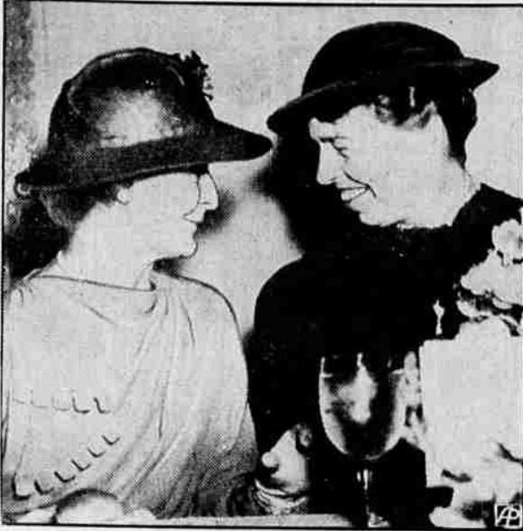
Mrs. Charles Evans Hughes (left), wife of the chief justice of the United States, and Mrs. Franklin D. Roosevelt were guests of honor at a luncheon in Washington. They are shown chatting informally. Chief Justice Hughes is one of the six justices who would be affected by President Roosevelt's court reorganization program.

12 years. He has been operating a pear orchard and last year marketed about 30,000 boxes of the fruit through Southern Oregon Sales, Inc. He owns two tracts. The Brookhurst orchard comprises 60 acres, and to the north is another tract of 86 acres.