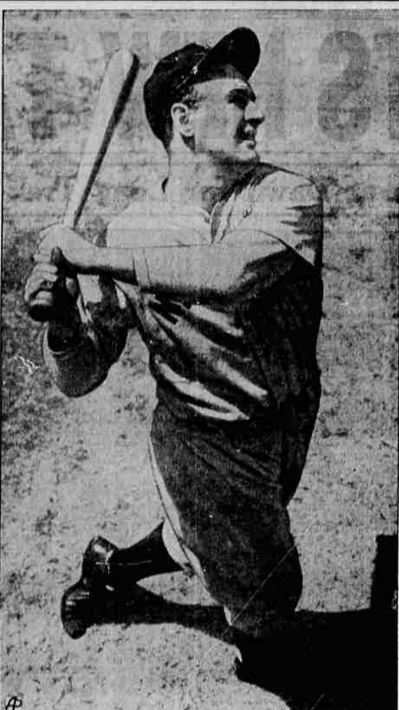
Lou Gehrig, the indestructible Yankee, turned up with a painfully injured finger on his right hand today, but with every intention of playing his 1809th consecutive game in spite of it. Gehrig captains the world champion Yankees in the New York opener with Washington.