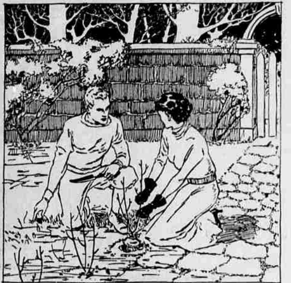
"I was a bit worried about whether you had enough money to carry them all summer."

Chapter 25 New Job For Denny AS the daring idea came to Eve, the telephone rang. Everybody started, except Mr. Cleveland, used to having secretaries answer for him. Judge that well-trained child, rose from where he lay on his stomach on the hearthrug, went out and came back, reporting, "Denny wants you, Eve." She was in the dark dining room in a flash. "Denny!" "Eve darling!" Before he could say any more, she began to talk excitedly. "Denny, Denny darling, old Mr. Cleveland is in this very house as ever was, playing chess with Peter, and he isn't an old sinner at all, he's a nice simple kind person and I'm going to