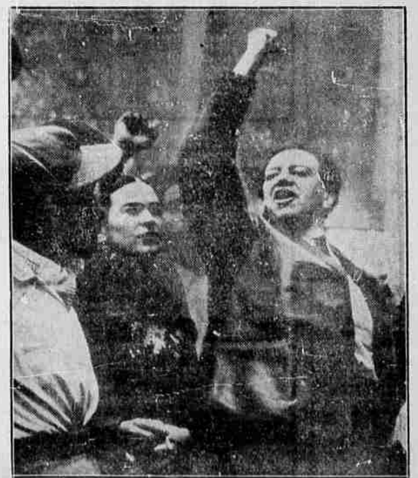
Diego Rivera, noted Mexican muralist whose radical tendencies got him into a controversy with the Rockefeller Center at New York, raised his fist in this Communist salute during Mexican labor's anti-Fascist demonstration at Mexico City. At his right is his seldom photographed wife.