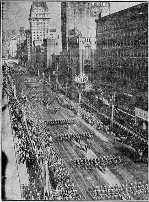
Here is a view down San Francisco's Market street as a crowd estimated by police at 500,000 lined the curbs and perched themselves in buildings to view the big civic parade to celebrate the opening of the San Francisco-Oakland Bay Bridge. It was the biggest throng ever to witness a parade in San Francisco. Marching in the foreground are units from the United States battle fleet.