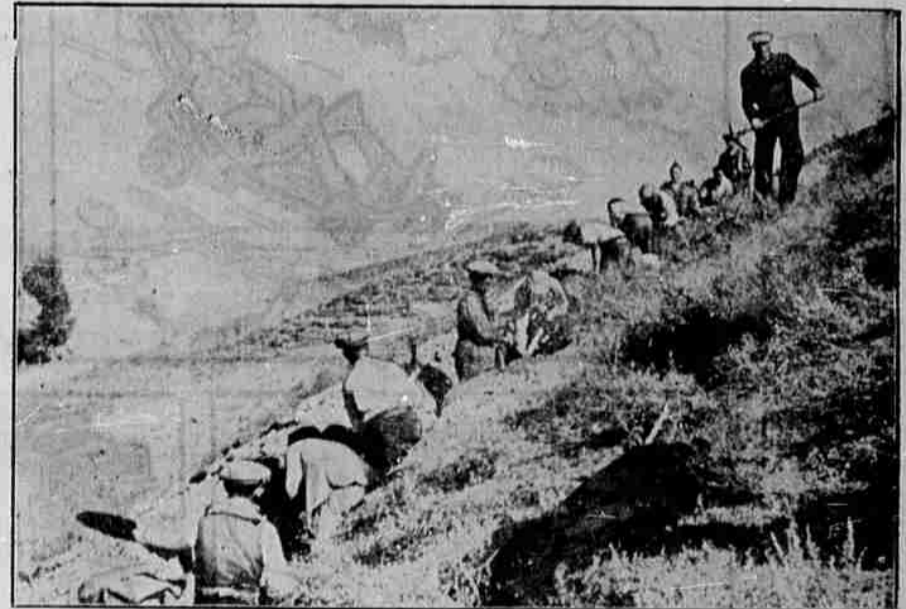
Anticipating a siege of Madrid with the advance of Spanish insurgent troops upon the capital, volunteer loyalist workers are shown digging trenches to fortify the city.