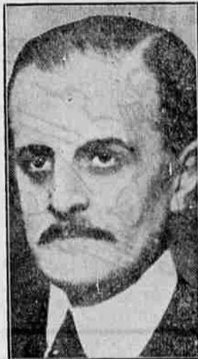
Carlos Saavedra Lamas (above), Argentine foreign minister who has been prominent in the League of Nations, was awarded the Nobel peace prize for 1936. Lamas will play a prominent role in the Inter-American peace meeting at Buenos Aires, to be attended by President Roosevelt.