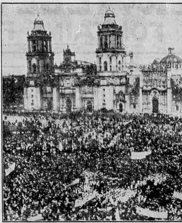
On the twenty-sixth anniversary of the revolution that ended the 30-year dictatorship of Porfirio Diaz, thousands of radical Mexican laborers participated in this huge mass meeting in front of Mexico City's ancient cathedral. Speakers denounced Fascism.