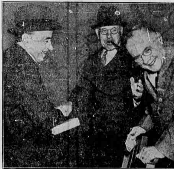
These three leaders in the fight against the Lewis "rebels" are pictured conferring on the floor of the American Federation of Labor convention at Tampa, Fla., which voted to continue the C. I. O. unions' suspension. Left to right: Matthew Woll, chairman of the resolutions committee; John P. Frey, who made the "insurrection" charges that led to the suspension, and William Green, A. F. of L. president, who said, however, "The door is still open, the hand of fellowship is still extended."