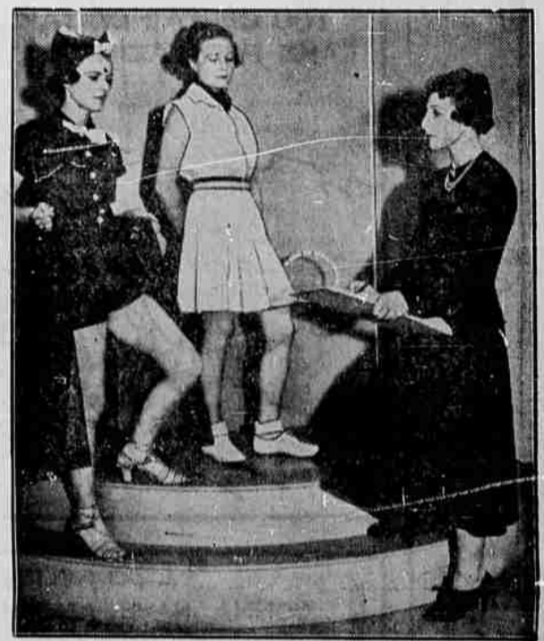
Mrs. Helen Wills Moody, many times women's tennis champion, has turned to dress designing. Here are two of her sports ideas as she gave them a final inspection at New York before placing them on the market.