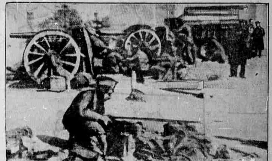
Main traffic arteries in Madrid were heavily bombarded by insurgent artillery, some of which is shown in the suburb of Alcoron. Defenders of the Spanish capital blew up a railroad bridge in an effort to check the advance. This picture was wired to London and radioed to New York.