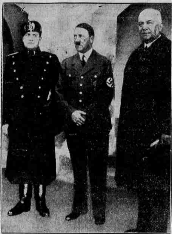
A definite accord to face European problems together was reached by Foreign Minister Galeazzo Ciano (left) of Italy and Reichsfuehrer Adolf Hitler (center) of Germany when they held conversations at the latter's Alpine home at Berchtesgaden, Germany. Shown with them is Baron Konstantin von Neurath, German foreign minister.