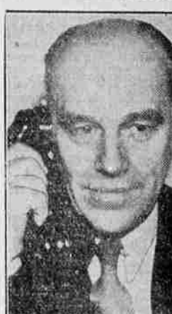
Rep. Ernest Lundeen (above), Farmer-Laborite, was advanced to a seat in the U. S. senate from Minnesota.