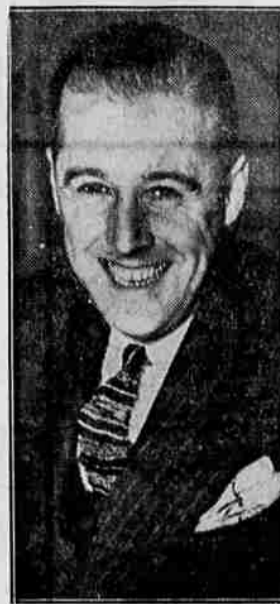
Warren G. Magnuson, Seattle county prosecutor, was swept by the tide of Democratic votes into the congressional seat held by his friend, the late Marion A. Zioncheck, whose fatal leap ended his turbulent political career. Magnuson is pictured with a broad smile after learning of his election.