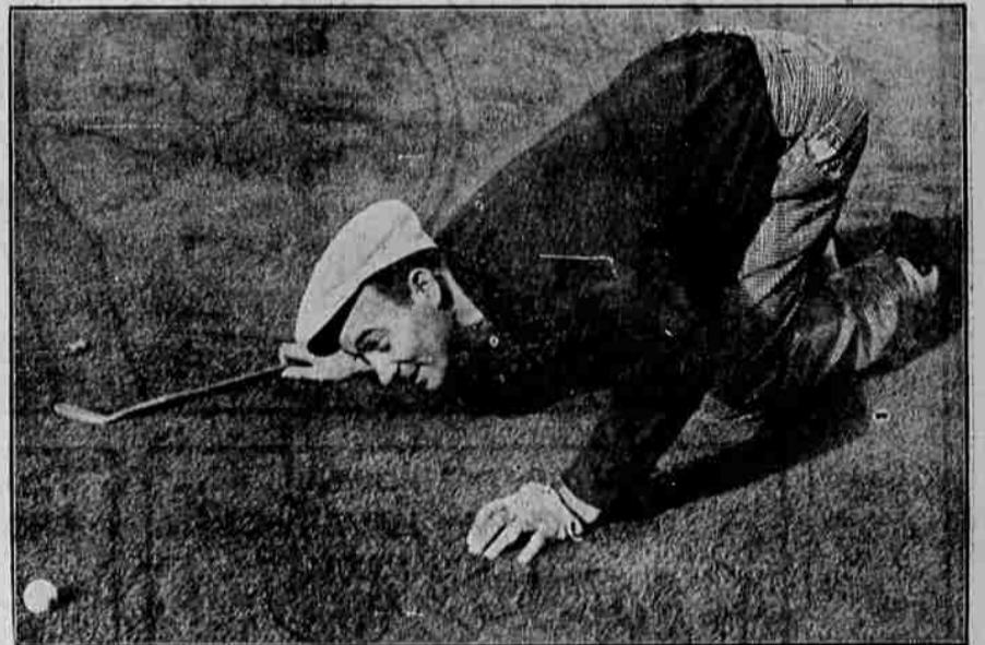
Golf is the leading item on the program of Tony Lazzeri, one of the New York Yankees' biggest World Series heroes, since he returned to his Millbrae, Calif., home after the baseball wars. Instead of hitting a homer with the bases loaded to tie a series record, it's a question of sinking that crucial putt. And here's Tony getting the right line.