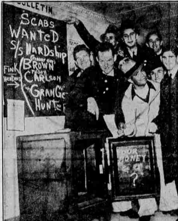
When officers of the International Seamen's Union in New York opened an office to "take recruits" to help thwart the strike of the seamen's defense committee in sympathy with the Pacific Coast waterfront walkout, these strikers balked the move by "capturing" the office and filling it so no applicants could squeeze in.