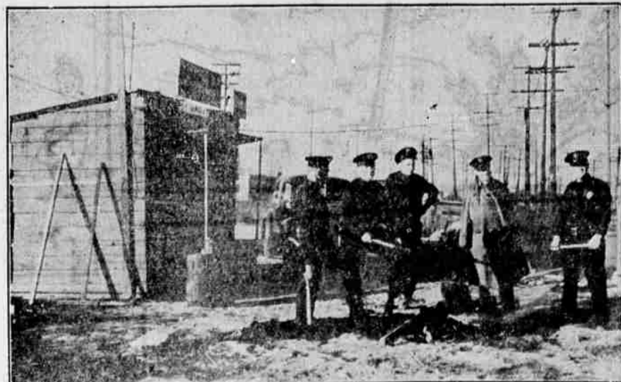
Los Angeles police on duty in the Pacific Coast maritime strike are shown by a shelter built between railroad and interurban lines running to Terminal Island at the harbor at Wilmington, Calif. Some 400 policemen were assigned to port service during the emergency.