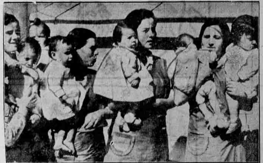
Too tiny to realize what it is all about, these children were brought to Madrid by their mothers from nearby territory since occupied by Fascist troops in their drive upon the Spanish capital. A difficult problem of providing food and shelter for thousands of refugees faced the government.