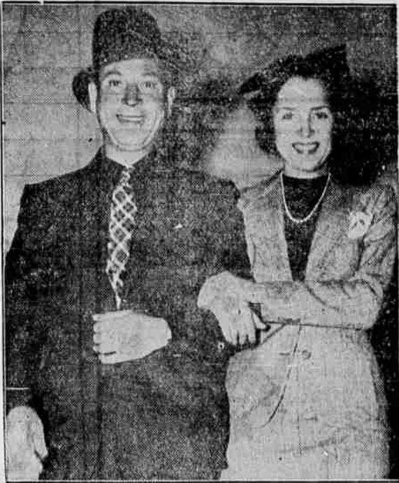
Harpo Marx, the silent member of that mad Marx brothers team of the screen, and Susan Fleming, film actress, smilingly announced at Hollywood that they had been secretly married two months ago. But Harpo said he couldn't recall just where it was the ceremony took place.