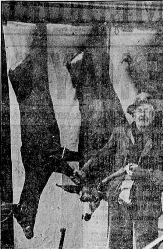
This picture shows that U. S. Senator James Pope of Idaho had plenty of evidence that he bagged his deer upon his return to Boise from a hunting party.

Jap Ship to Sail. PORTLAND, Ore., Nov. 12.—(AP)—Agents for the Getaayo Maru, Japanese freighter and last of the offshore ships remaining in this area since the waterfront tie-up, said today the vessel would leave Friday for Port Alberni, B. C., to load wheat and lumber. Only oil tankers are moving.