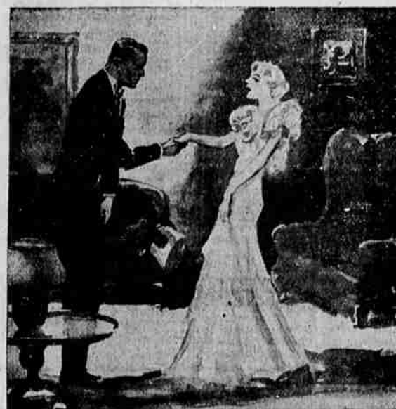
"So glad you could come," said Elsa.

IT WAS soon after six when Mahony left Bassett and returned to Clarkford's. There he interviewed an assistant, obtained a few tips about means of disguising himself, and bought the materials necessary for a disguise. After that he returned to his lodgings and changed into evening clothes for his dinner appointment with Elsa Little.