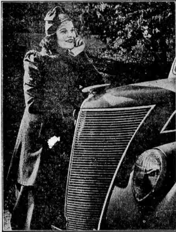
KEYNOTE OF LINES of the new Ford V-8 for 1937 is sounded by the frontal appearance, pictured above. The nose is sharp and rakish like the prow of a speed boat. The upper part of the radiator grille is carried back in a pleasing curve deeply into the hood side. Head lamp are in "tear drop" form, faired into the streamlined fender aprons. The hood top is hinged at the back, lifts from the front, locks with an airplane motif radiator emblem.

Beyond the appearance and the two engine sizes, two other important features mark the new 1937 cars. One is a new all-steel body, with new one-piece steel top, as well as steel structure, panels and floor. The other is a new braking system, designed by Ford to give "soft" easy-action control. The brakes are actuated through a cable-and-conduit system and have controlled self-energizing action, providing the safety of steel throughout the entire mechanism.