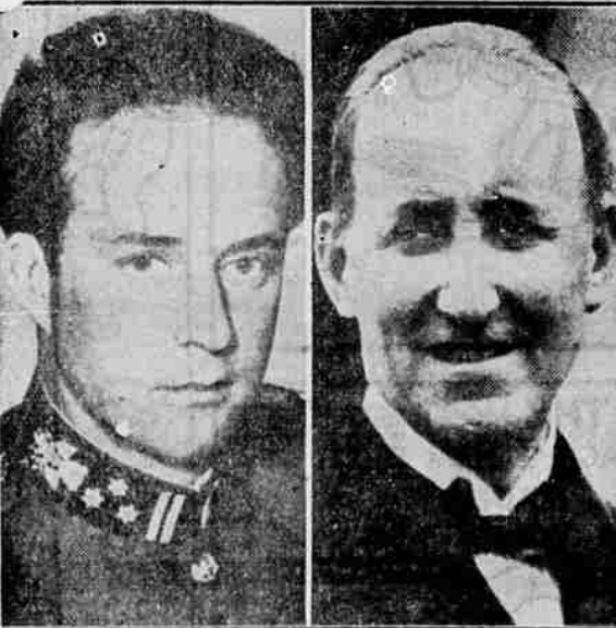
King Leopold (left) of Belgium and Lord Plymouth (right) of England took prominent roles as Europe's affairs reached a new crisis. Lord Plymouth, chairman of the committee to control non-intervention in the Spanish Civil War, was handed strongly worded Russian demands for a virtual blockade of Portuguese ports. King Leopold announced reversal to Belgium's pre-war policy of isolation and neutrality.