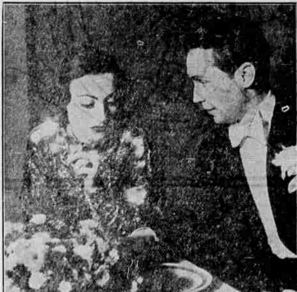
Though they wouldn't disclose the date, Joan Crawford and Franchot Tone of the movies, shown here dining together at their Hollywood home, have celebrated the first anniversary of their marriage. "We ate a wedding cake, ran a picture in our projection room and sat there holding hands," said Miss Crawford.