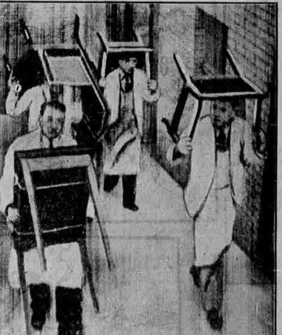
Movers are shown in this radiophoto from London removing the furniture of Mrs. Wallis Warfield Simpson, friend of King Edward VIII, from her apartment in Bryanston Court to her new residence on Cumberland Terrace. She has separated from her husband and filed a suit for divorce.