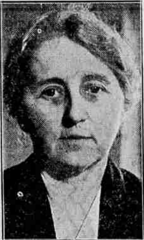
Miss Reah M. Whitehead (above), Seattle justice of the peace, advocated whipping posts for women, too, with women whip wielders if the Washington state legislature approves a state bar committee recommendation for whipping posts for male offenders. "I'm against any whipping," she said, "but women's skins are no tenderer than men's."