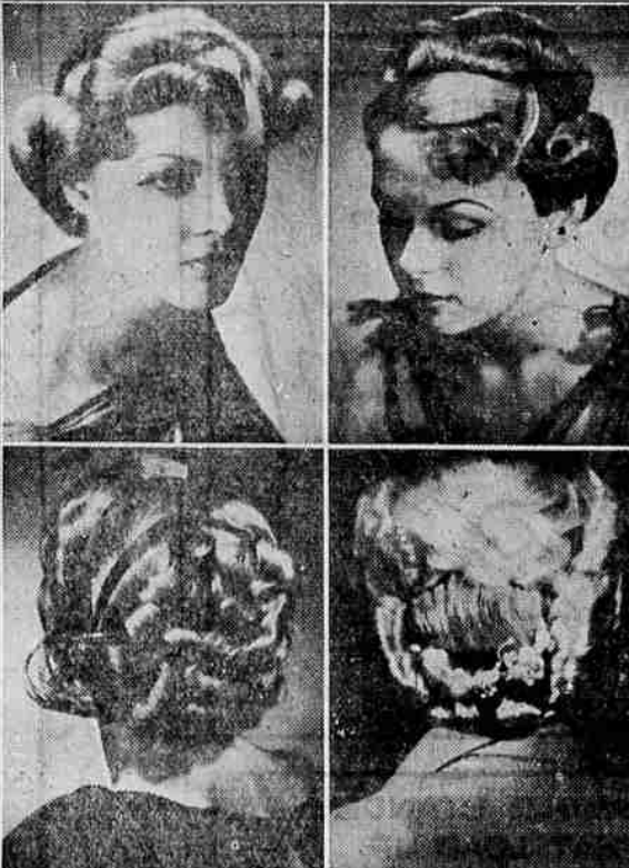
The dictators of hair styles for millady have decreed curls—the more the merrier—for the coming season, and here are New York mannequins showing some of the uses to which curls have been put. The coiffures shown at left feature "banks" of curls. Upper right, a modern version of the empress pompadour effect. Lower right, one version of the new "coronation" hairdress.