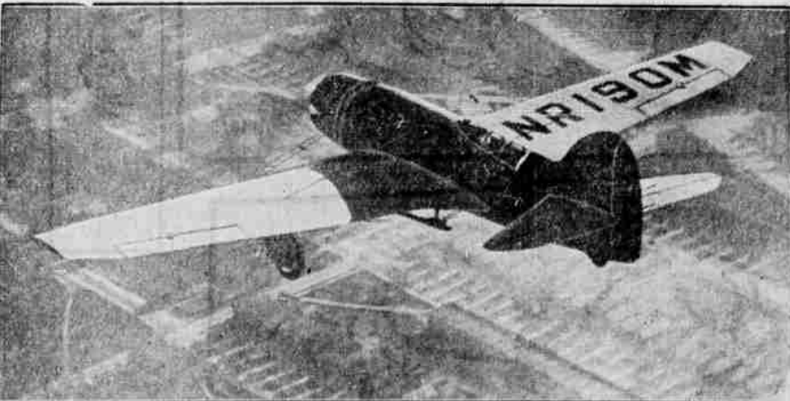
Here is the low-wing, single-cockpit plane of Capt. James Mollison as it left New York on a one-stop flight to London. The plane has a sliding hood to convert it into a closed type. Mollison intended to navigate only with a gyroscope compass and artificial horizon.