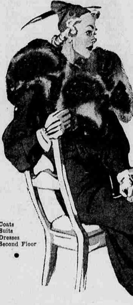
Coats Suits Dresses Second Floor

This November Economy Event offers the season's first reduction on Fur Trimmed Coats. In this $16.00 selection are our regular $19.75 values. Coats with lovely fur collars and tailored from all wool coatings. The colors include black, brown and green. The sizes 14 to 44, which offers you ample selection. Buy your fur trimmed coat tomorrow at Mann's.