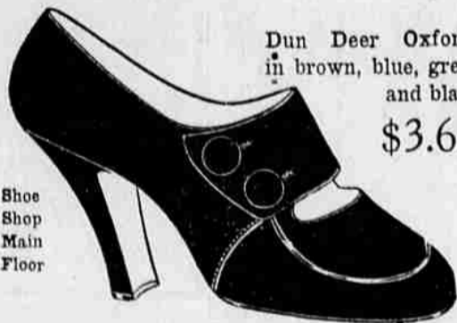
Shoe Shop Main Floor

Dun Deer Oxfords in brown, blue, green and black $3.65