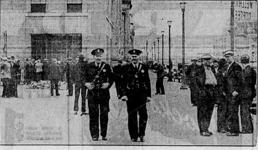
The San Francisco waterfront remained quiet although maritime pickets took their posts as 37,000 marine workers walked out in a maritime strike. Extra police patrols, however, were ordered to the Embarcadero. Here are two police officers walking their beat, with groups of idling pickets close by.