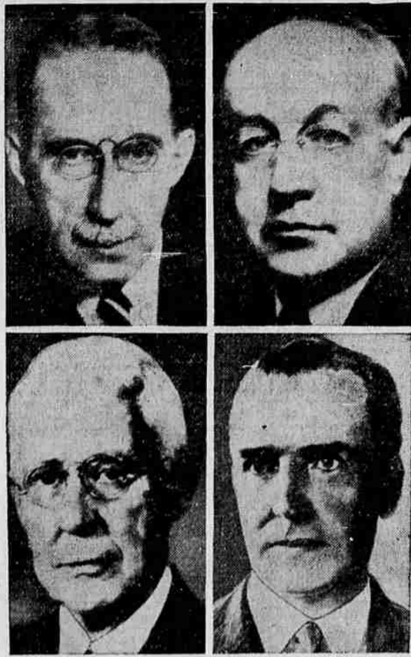
Here are four of the new Democratic senators who were swept to victory in the landslide vote for President Roosevelt. Gov. Theodore F. Green (upper left) of Rhode Island defeated Sen. Jesse H. Metcalf, Gov. Clyde L. Herring (upper right) of Iowa defeated Sen. Lester J. Dickinson, James L. Hughes (lower left) of Delaware scored over Sen. Daniel Hastings, and William Smathers (lower right) of New Jersey defeated Sen. J. Warren Barbour.