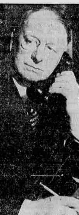
Col. Frank Knox, Republican vice presidential candidate, is shown in his Chicago newspaper office as the latest presidential election data came in by telephone as he jotted down figures on a pad of paper. The returns showed the re-election of the Democratic nominee, President Roosevelt.

Radio announcers at the new British Broadcasting corporation station at Burghhead, North Scotland, will wear kilts while at the microphone.