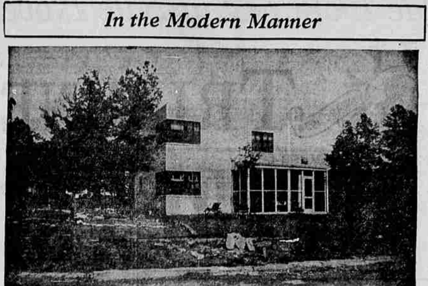
In the Modern Manner