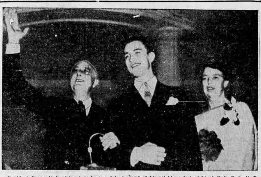
President Roosevelt is pictured as he waved to a crowd of his neighbors last night at Hyde Park, N. Y., after election returns showed an overwhelming vote for his re-election...