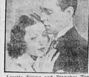
Loretta Young and Franchot Tone co-star for the first time in "The Unguarded Hour," which plays a return engagement today and tomorrow only at the Roxy theater. The story deals with the "unguarded hour" every woman dreams about and every man thinks about. It's filled with the things that make real pictures come true.

Others in the cast are Lewis Stone, Roland Young and Dudley Digges.