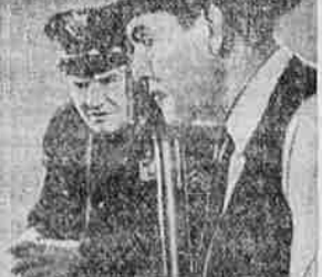
Loretta Young and Franchot Tone co-star for the first time in "The Unguarded Hour," which plays a return engagement today and tomorrow only at the Roxy theater. The story deals with the "unguarded hour" every woman dreams about and every man thinks about. It's filled with the things that make real pictures come true.

Others in the cast are Lewis Stone, Roland Young and Dudley Digges.