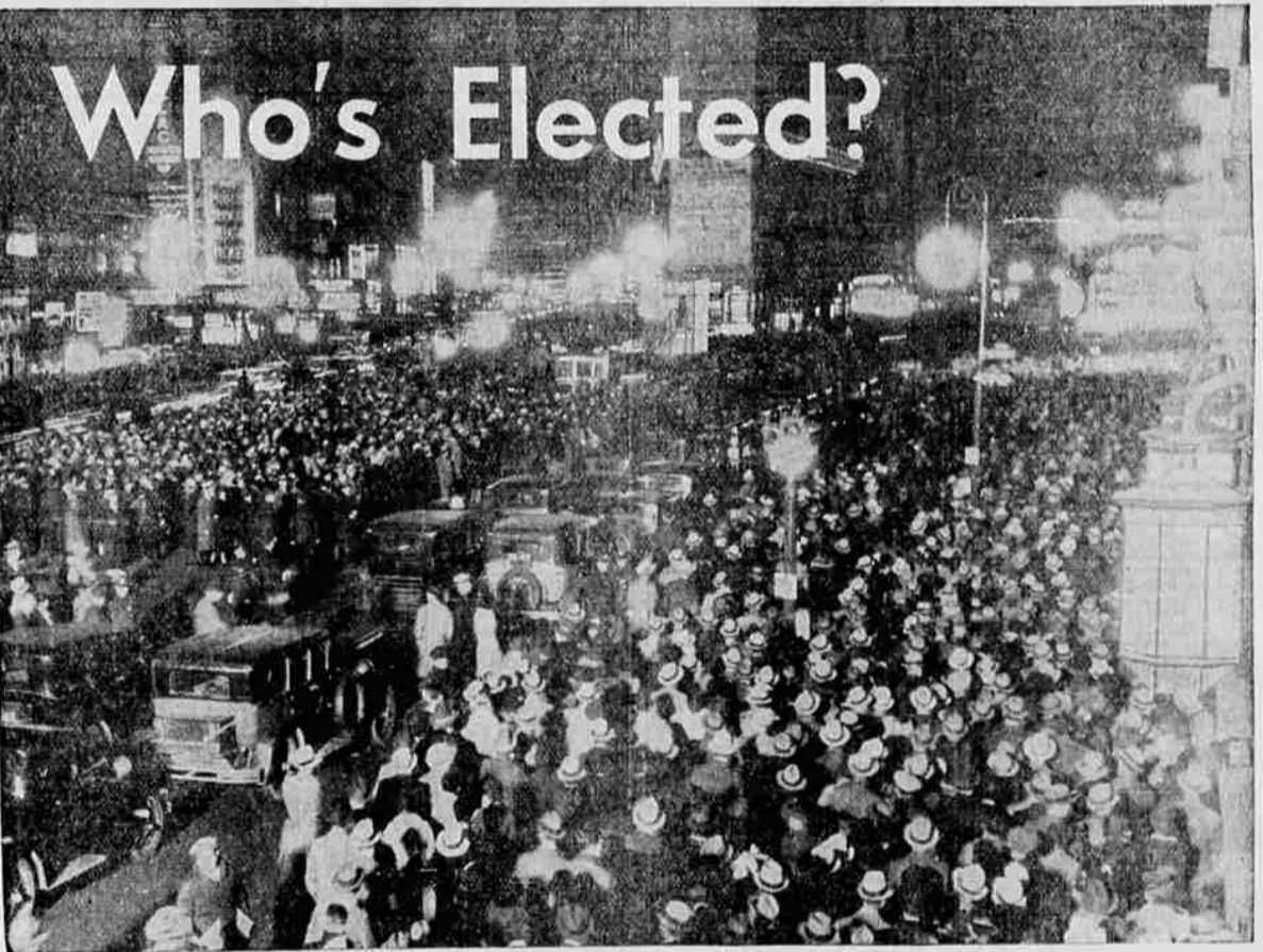
TIMES SQUARE ON ELECTION NIGHT