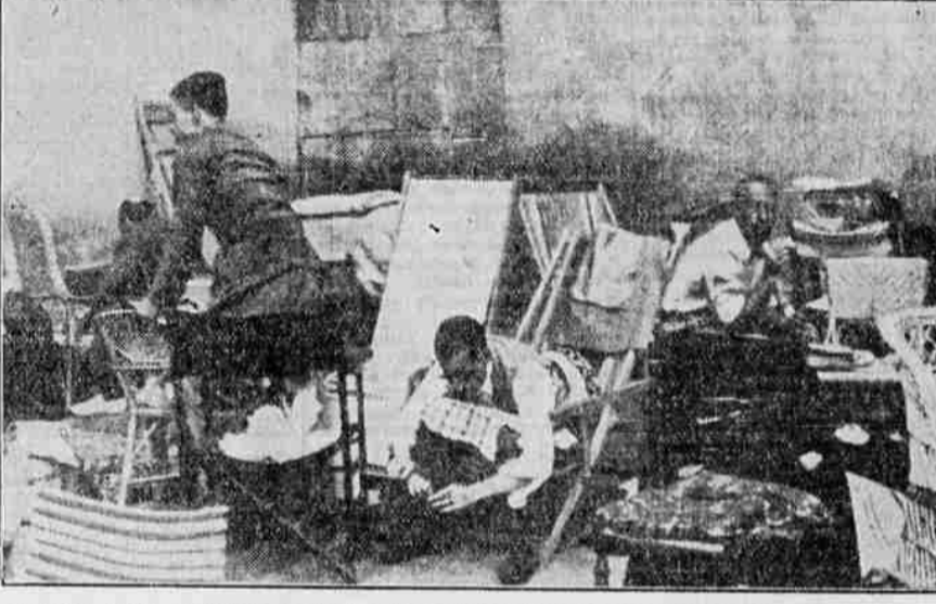
Captured in the Guadarrama mountains where they had gone to spend vacations, these wealthy Spaniards were taken by government forces to El Escorial for imprisonment. They are shown as they prepared a meal while awaiting execution.