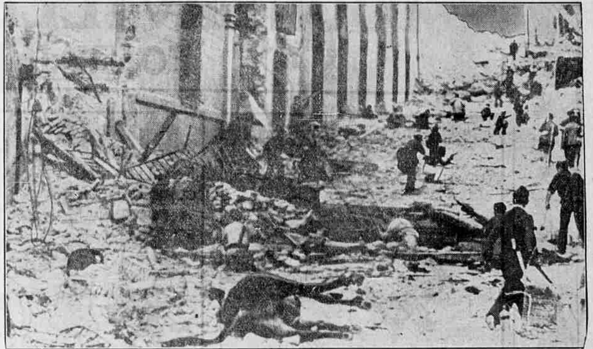
This picture, one of the most remarkable to come out of war-torn Spain, shows Fascist insurgents advancing stealthily through the ruins of the outer courtyard of the Alcazar at Toledo to drive out the last of the loyalist troops before freeing the heroic defenders of the old fortress-palace, who had withstood a ten-weeks siege. Some of the soldiers are crouching behind barricades. The dead mule in the foreground tells another grim tale of war.