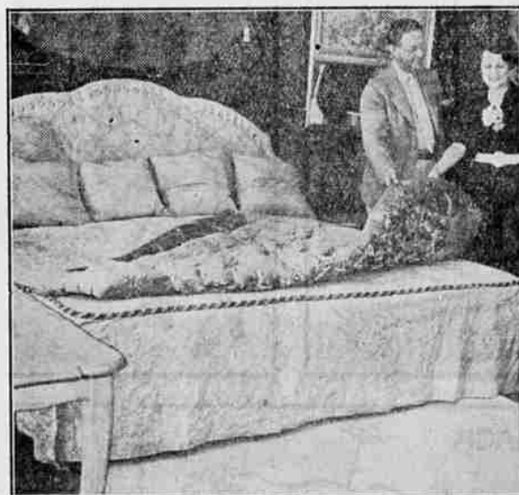
This bed on which John Gilbert, the film actor, died was put up for auction at Hollywood with the rest of his household furnishings. Two attendants at the auction inspect the bed, which was described as one of the largest ever made.