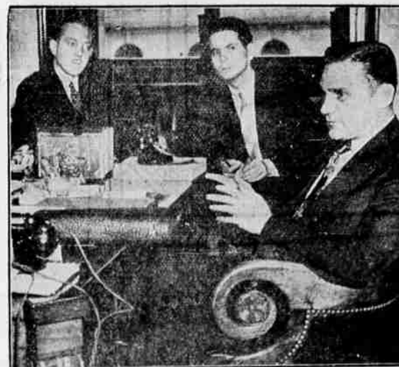
U. S. Senator Gerald P. Nye (right) is pictured with reporters at Washington as he discussed the Fokker affidavit before the Senate Munitions Committee in which Elliott Roosevelt, son of the President, was named as a party to a contract to sell planes to Russia.