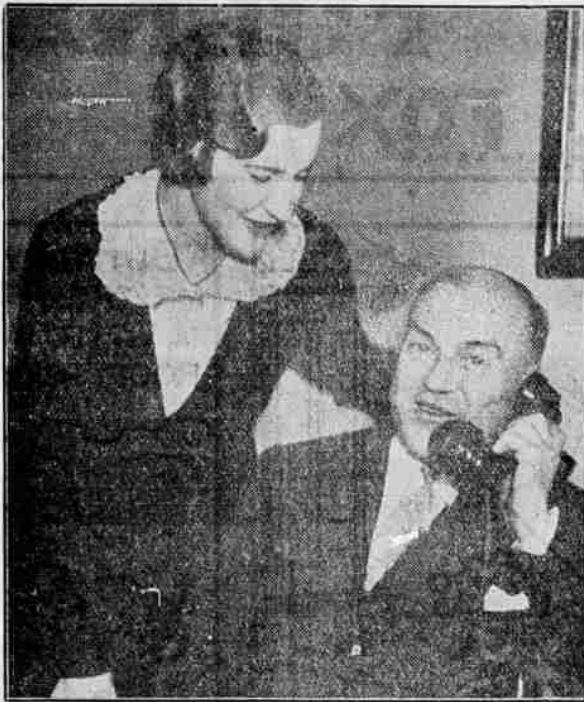
Appointed by President Roosevelt to fill, temporarily, the vacancy left by the death of George H. Dern, Harry H. Woodring, new secretary of war, is shown with his wife at their Alexandria, Va., home receiving telephoned congratulations.