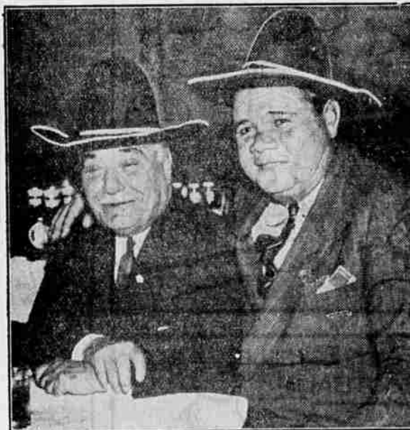
Babe Ruth, the former Yankee hero, and his one-time boss, Jacob Ruppert, who hadn't been on very friendly terms since the Babe left the Yanks, forgot all about it when they both attended a victory dinner celebrating the Yanks' triumphs over the Giants in the World Series at New York.