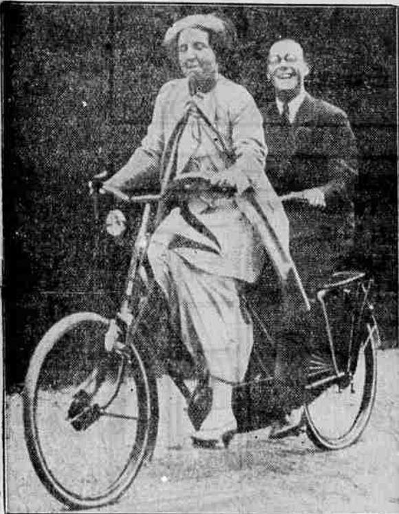
Princess Juliana of Holland and Prince Bernhard Zur Lippe Biesterfeld, whose engagement was recently announced, are shown enjoying the popular Dutch pastime of cycling in the park of the royal palace at The Hague.