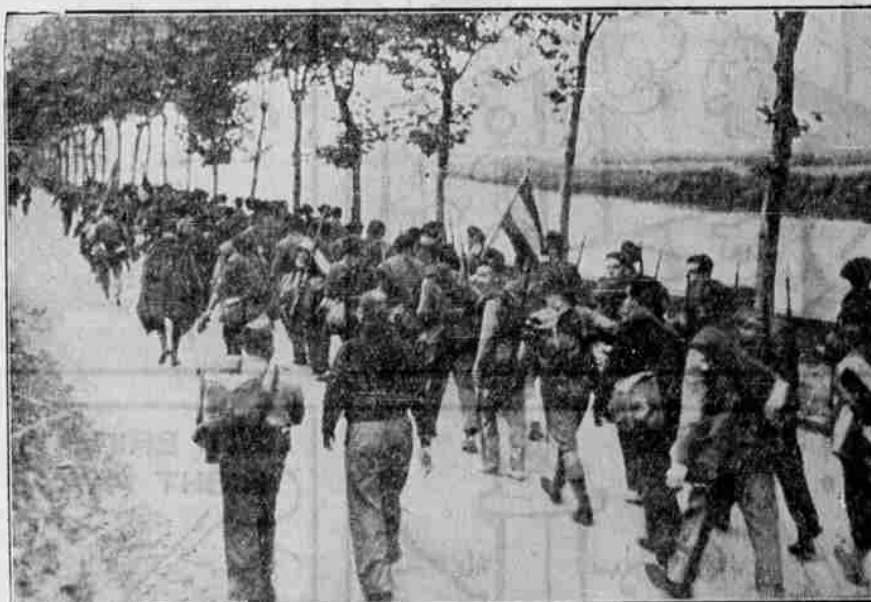
This picture shows a column of Spanish rebel troops marching on San Sebastian after conquering the nearby town of Irun. The Fascist forces have completed the occupation of San Sebastian and have set up a civil administration to govern the city.