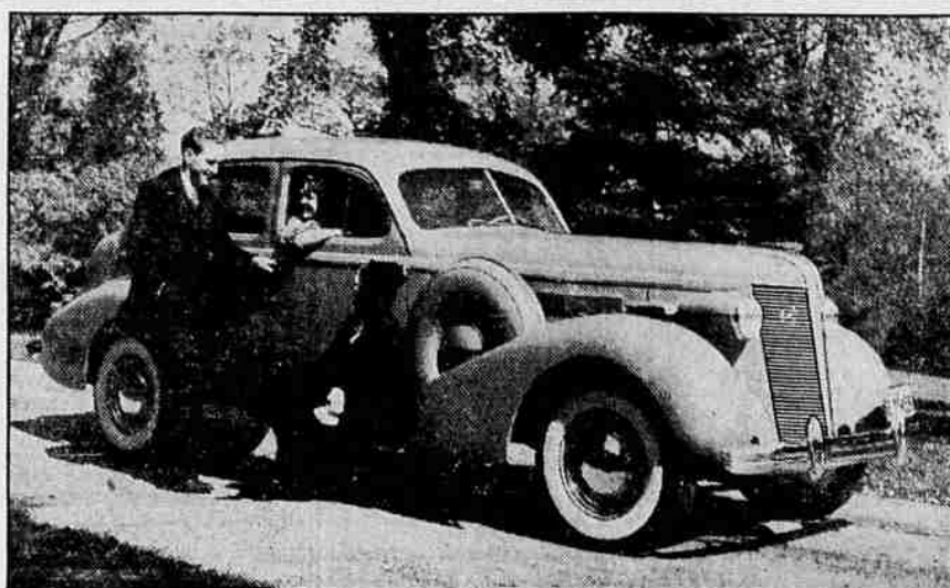
MORE POWER, greater comfort and smart new styling feature the new 1937 cars announced by the Buick Motor Company. Shown above is the new Series 60 Century five passenger sedan with built-in trunk. It is one of four new lines of Buick cars and is powered by a 130-horsepower, valve-in-head, straight eight engine. Wheelbase of this model is 126 inches.