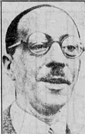
This is a candid camera picture of Fulvio Suvich, new Italian ambassador to the United States, upon his arrival at New York to assume his duties.