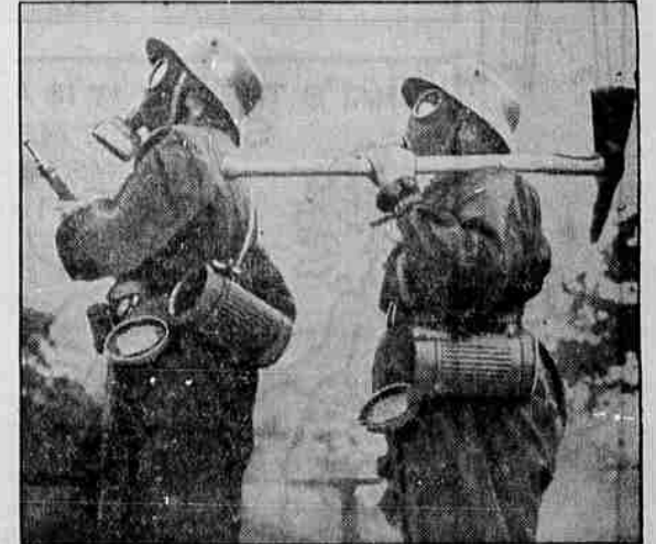
Equipped with steel helmets and pick-axes, these Nazi women are shown wearing gas masks, training prescribed by the air defense league, an organization of volunteers to be trained against possible air raids on Germany.