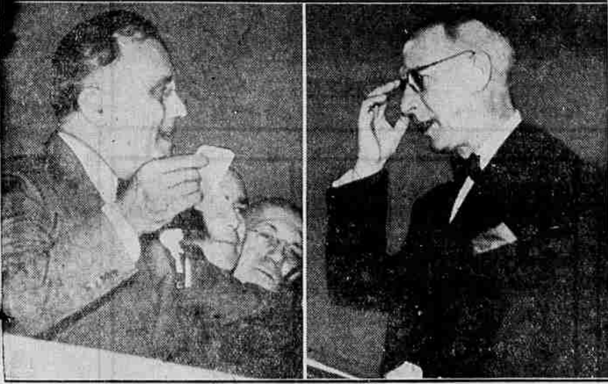
Al Smith, the "happy warrior" who was formerly the close political associate of President Roosevelt, bolted the Democratic party and announced his support of Gov. Alf M. Landon for the presidency in an address at New York in which he attacked the New Deal. The President (left) and Smith (right) are pictured as they appeared in almost simultaneous speeches, Mr. Roosevelt as he spoke at Pittsburgh, and Smith before a large New York audience.