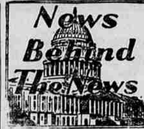
(Continued from Page One.)