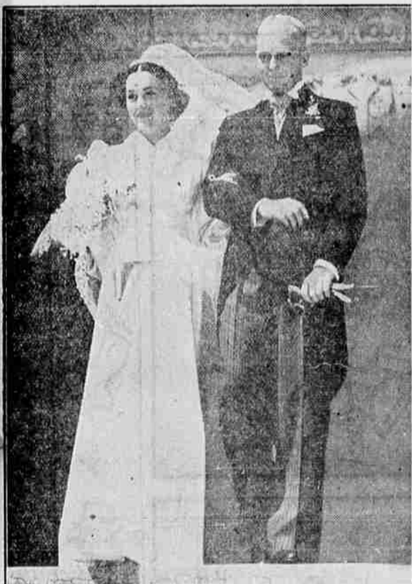
Maureen O'Sullivan, film actress, and John Farrow, writer and director, leaving the church at Santa Monica, Calif., where they were married. Picture work caused a delay in their honeymoon plans.