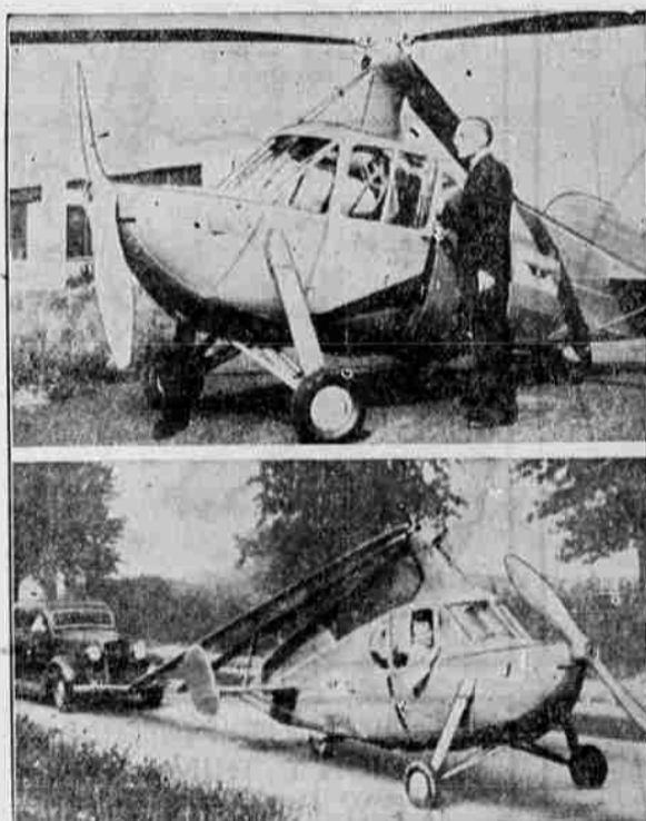
This new autogiro for use both in the air and on the highways was demonstrated for air officials at Willow Grove, Pa. Built for the federal bureau of air commerce, the plane's blades fold back, permitting road travel, as shown below. The ship can be parked in an ordinary garage. J. H. Geisse is beside it in the upper picture.