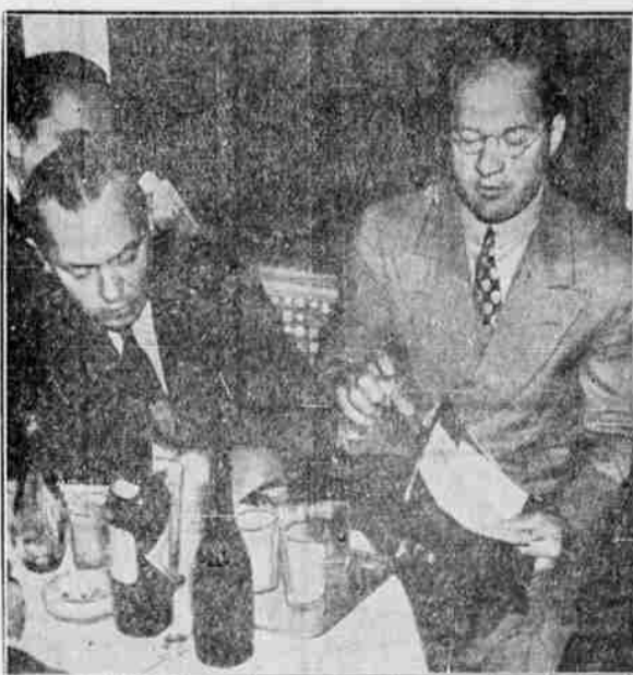
Avery Brundage of Chicago (right), head of the American Olympic Committee, is shown as he talked to reporters on his return to New York on the liner Vulcania. Brundage defended the committee's dismissal of Mrs. Eleanor Holm Jarrett, star swimmer, from the team on drinking charges.