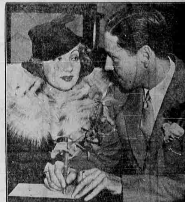
This is another Hollywood romance that reached the stage of matrimony. Ann Sothern, actress, and Roger Pryor, actor and orchestra leader, are pictured as they filed their notice of intention to wed at Los Angeles.