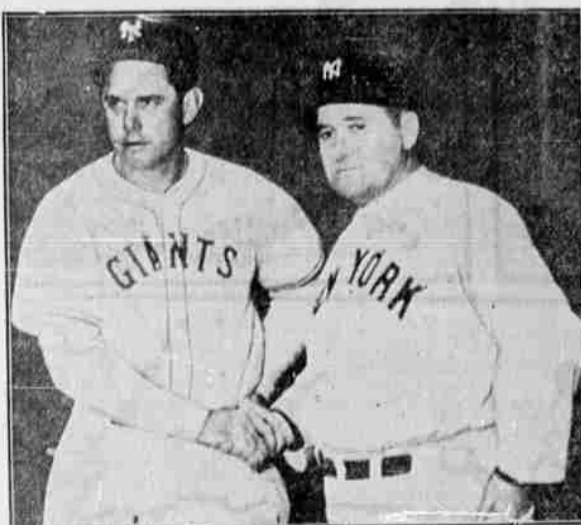
Manager Bill Terry (left) of the New York Giants and Joe McCarthy, who does the master-minding for the Yankees, paused for this handshake before the first game of the World Series in the New York Polo Grounds. Terry took the early edge as the Giants won behind Hubbell's pitching 6 to 1 in the cold and rain, worst series conditions in ten years.