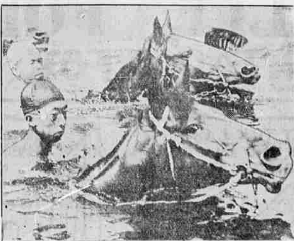
As part of his training for a commission as a cavalry officer, Prince Mikasa (in foreground with black skull cap), youngest of the three brothers of Emperor Hirohito of Japan, participated in the exercise of swimming mounts across a river. The prince recently graduated from the army cadet school.