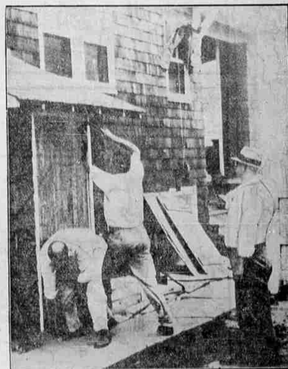
When warnings of the bitter hurricane which swept the Atlantic coast states were flashed, residents along the beach at Norfolk, Va., either boarded up for the big blow or fled their homes. This picture, made near Norfolk, shows men hastening to give what protection they might to their home.