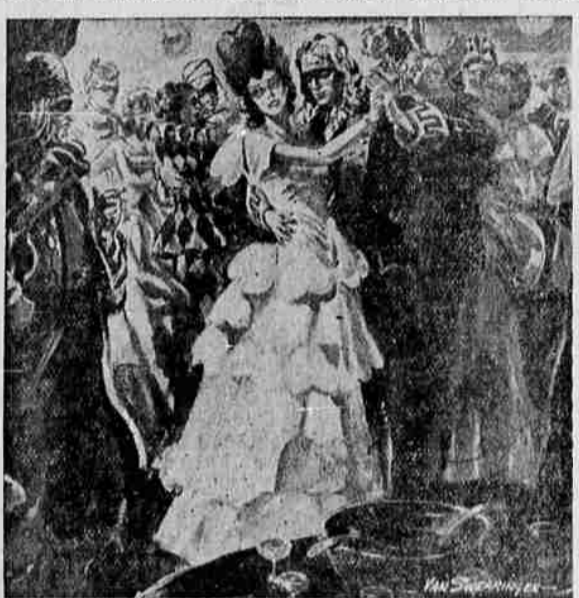
Terence noted every man with whom Elsa danced.

"Yes, I've met Mahony with poor Ross," he said. "You had rather a lucky escape, I understand."