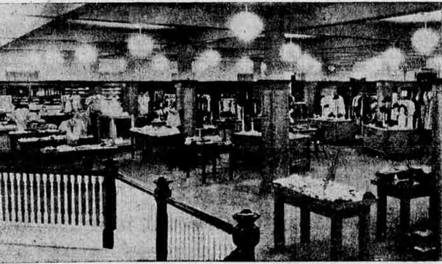
Mann's Department Store's store-wide program was completed in August, 1935, making this store one of the most modern and attractive in the state. Top view: A partial view of Mann's main floor from the Central avenue main entrance. A portion of the shoe department and men's section is shown in the extreme back. The men's department has an entrance on East Main street. Bottom: A glimpse of the second floor ready-to-wear and millinery departments. A spacious, attractive lounge, beauty salon, alteration rooms and offices are also located on this floor.