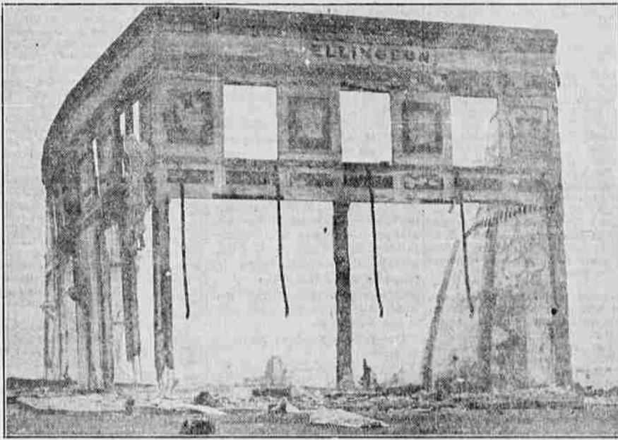
Typical scene (above) on the forest fire front in southwestern Oregon, where the flames destroyed Bandon. Damage from the holocaust ran into millions. Lower: Twisted wreckage of a business block in Bandon.