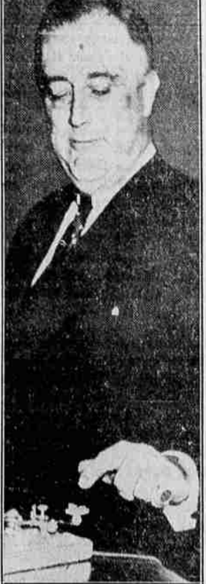
This picture was taken at the moment President Roosevelt pressed the "button" to start the Boulder Dam power plant in operation after he had addressed the World Power Conference at Washington.