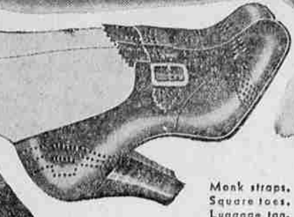
Monk straps. Square toes. Luggage tan.