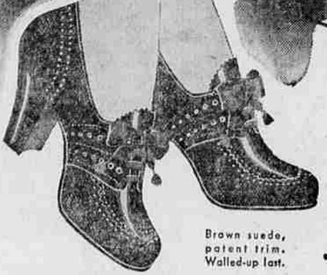
Brown suede, patent trim. Walled-up last.

Wards Nation-Wide Sale to Save Thousands of Families Thousands of Dollars