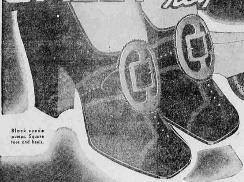
Black suede pumps. Square toes and heels.