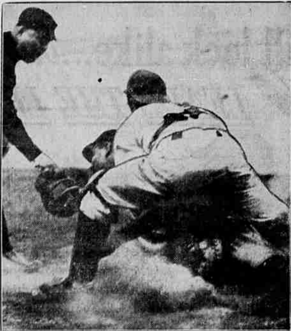
Here's how the New York Giants finally clinched the National League pennant and the right to meet the New York Yankees in a "subway" World Series. Third Baseman Travis Jackson hit the dirt at the plate in the tenth inning of the first game of a double-header with the Boston Bees to score the winning run. Catcher Lopez tried in vain for the putout. Jackson scored on a hit by Pitcher Hal Schumacher.

tion as world series sluggers to uphold. The celebrated iron man, Lou Gehrig, is a hold-over from the powerhouse teams that flattened the opposition 12 times in a row, in 1927, 1928 and 1932.