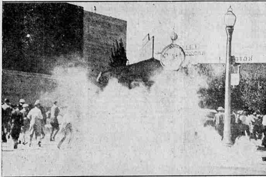
This illustrates what happened when tear gas bombs were thrown in clashes between police and strike pickets in the lettuce workers' walkout at Salinas, Calif. The pickets are fleeing the smoky fumes.