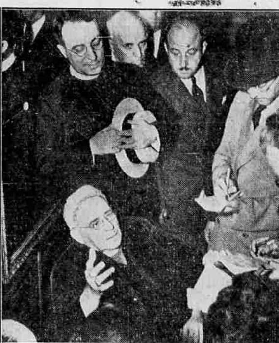
On his return from Italy aboard the liner Rex Bishop Michael J. Gallagher (front, center) of Detroit said Vatican authorities were displeased at the Rev. Charles E. Coughlin (left, rear), who later apologized for the statement, met his superior at the dock in New York.