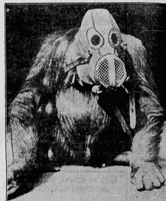
Behind the mask is "Norsuto," six-year-old male orang-utang, born at the Philadelphia zoo. The mask will keep him from scratching his eyes after doctors remove cataracts. Note the grill work to be opened at feeding time.