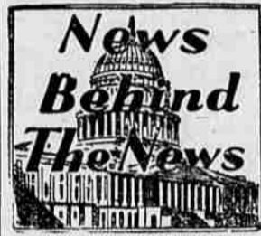
(Continued from Page One.)

occupants of the plane were not able to see with equal clarity over the same distance and distinguish two American flags on the destroyer, one flag on an awning and the other at the masthead.