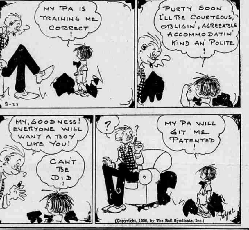
MY PA IS TRAINING ME CORRECT! PURTY SOON I'LL BE COURTEOUS, OSLIGIN, AGREEABLE ACCOMMODATIN' KIND AN' POLITE! MY, GOODNESS! EVERYONE WILL WANT A BOY LIKE YOU! CAN'T BE DID! MY PA WILL GIT ME PATENTED! 8-27 (Copyright, 1936, by The Bell Syndicate, Inc.)