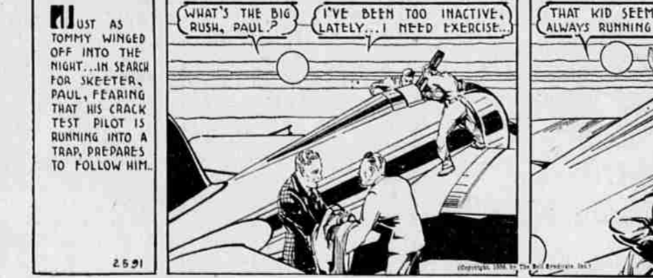
JUST AS TOMMY WINGED OFF INTO THE NIGHT... IN SEARCH FOR SKEETER, PAUL, FEARED THAT HIS CRACK TEST PILOT IS RUNNING INTO A TRAP, PREPARES TO FOLLOW HIM. WHAT'S THE BIG RUSH, PAUL? I'VE BEEN TOO INACTIVE, LATELY... I NEED EXERCISE... THAT KID SEEMS TO HAVE A PENCHANT FOR ALWAYS RUNNING INTO TROUBLE... BUT... THIS TIME... I AIM TO BE WITH TOMMY... JUST IN CASE... 2591 (Copyright, 1935, by The Bell Syndicate, Inc.)