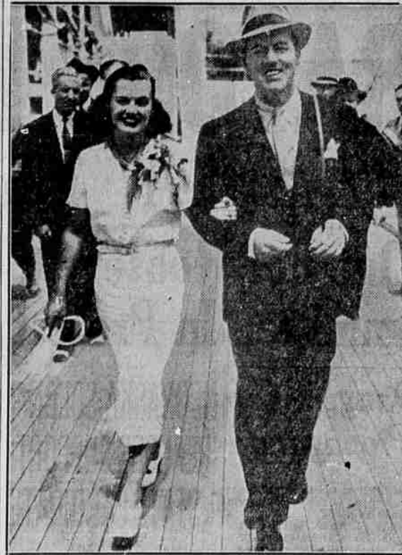
Eleanor Holm Jarrett and her husband, Art Jarrett, orchestra leader, shown on the deck of the Bremen as they returned to New York. The swimmer said she did not plan any legal action against Avery Brundage of the Olympic Committee as a result of being barred from the Olympic games.