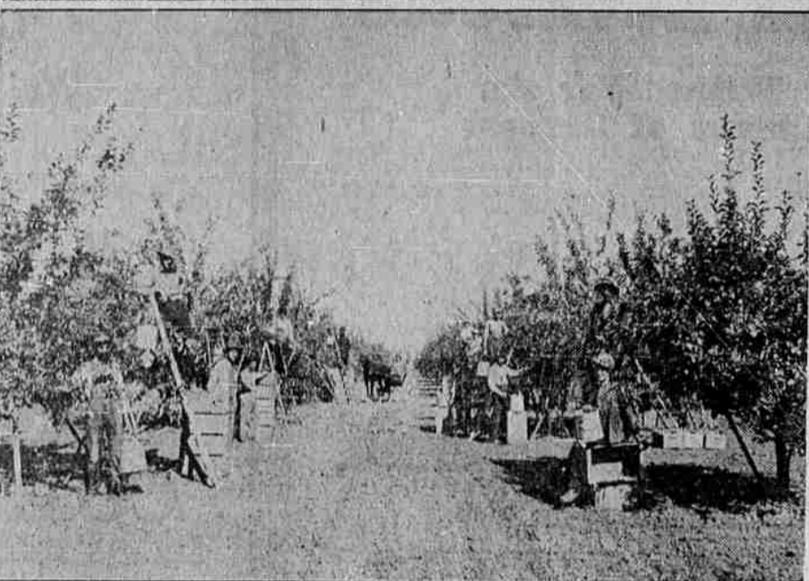
Many persons are employed in the 17 orchards of the Orchard Park Farms, Inc. Upper scene above: The tree branches are carefully pruned to permit all fruit to receive a maximum of sunshine and equal distribution of sap from the trunk. Spraying also requires the services of many helpers. Below: The orchards present a busy scene during picking season.