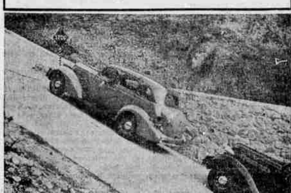
Photo showing 1935 Studebaker at full stop on a steep hill. The automatic Hill Holder, exclusive with Studebaker, prevents the car from backing down grade. Operation, it is claimed, requires only normal driving technique, namely, pushing both clutch and brake pedals forward at the same time, following which the foot brake can be released, leaving the right foot free to manipulate the accelerator when restarting the car.