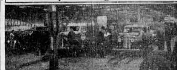
With the Dodge truck plant output reaching high levels this month, the above picture gives evidence of the wide variety of types and sizes of trucks and commercial cars that are coming off the assembly lines every day.