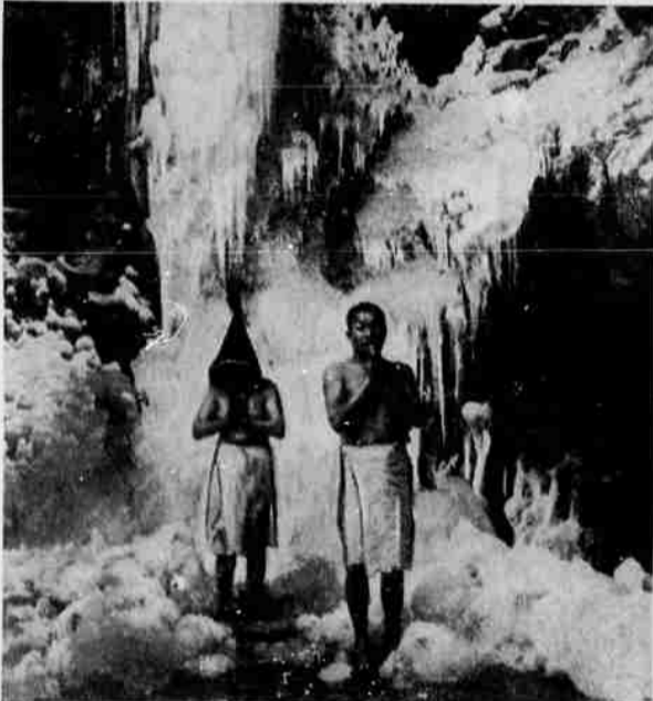
Kan-mairi, a centuries-old purification rite, is still performed in Americanized Tokyo as in the ancient past. The picture shows two laborers about to plunge under a zero-cold waterfall.

With a clapping of the hands that resounds sharply in the frosty air, they shout, "Zange,