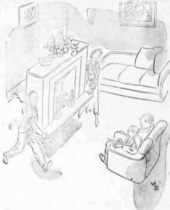
"Don't bother moving your chair. It's a portable fireplace."

Radio sponsors, we read, are anxious to give the public what it wants. This makes it look as if one or the other is crazy.