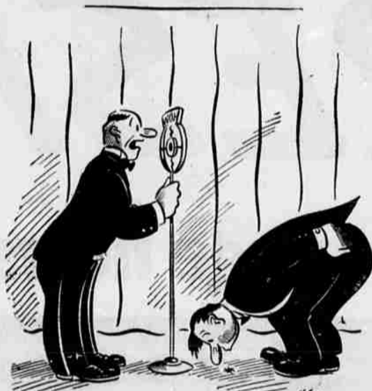
"Please bear with us a moment—the bird imitator just saw a bug!"