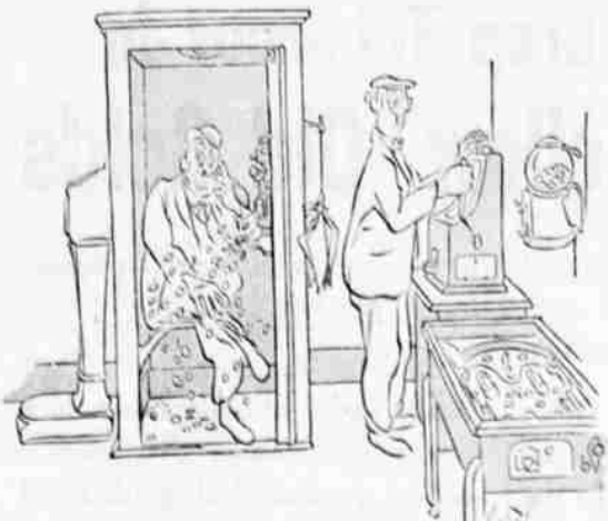
Some people have all the luck!