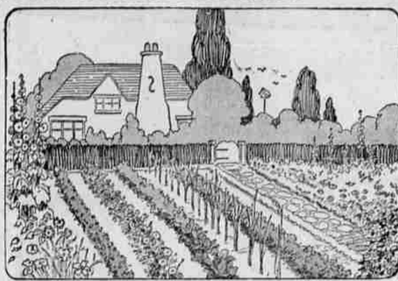
A Beautiful Vegetable Garden May Be Made by Planting Annual Flowers in Rows and as Edging. They can Be Used for Cutting.

The amateur who grows vegetables as a recreation has it all over his fellow hobby riders, for his playtime hours at this avocation not only cost him nothing, but actually save him money.