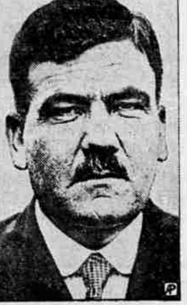
Because of suspected anti-government agitation and attempting to provoke U. S. intervention, the Mexican government this morning forced Gen. Plutarco Elias Calles, former president, to board a plane for Texas.