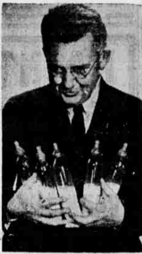
Five bottles — five babies. Jean Hersholt, as "The Country Doctor" in the film of that name, opening today at the Craterian theater, has the de- lightful task of giving the famous Dionne Quintuplets their regular daily feeding during the course of the picture.

Their first full-length feature ap- pearance has the Quints playing themselves in a story revolving about the dramatic episodes in the life of a rural medic.