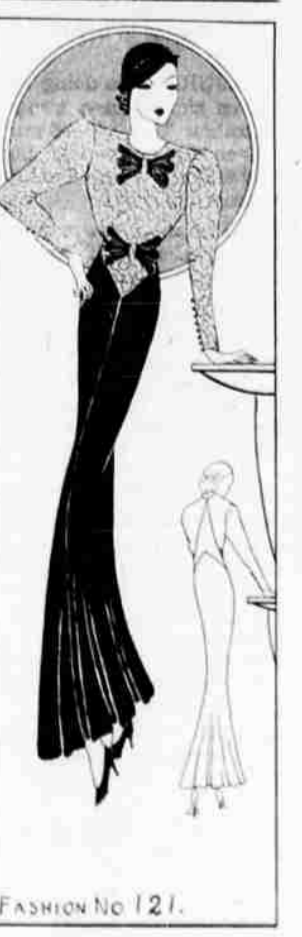
FASHION No. 121.

Size 16 requires 2¼ yards 39-inch material or 1½ yards 54-inch contrast. Sizes 14, 18, 20 years. Adaptable materials, canton crepe, dull satin, novelty silk, ribbed silk, faille.