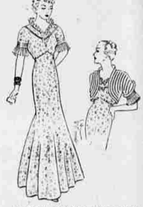
The woman who adores fluffiness and ruffles will delight in this cocktail gown, possessing ruffy softness around the neck and pleating at the edge of the sleeves. The removable bolero jacket, detailed in design, is the peak of fashion this coming season.

The younger woman employing the same medium, dress, will ex-