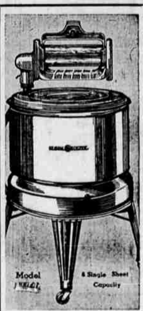
Model 1746L 4 Single Sheet Capacity